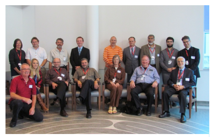
Chaplains and volunteers by the labyrinth in the new Southwest Centre for Forensic Mental Health Care chapel.